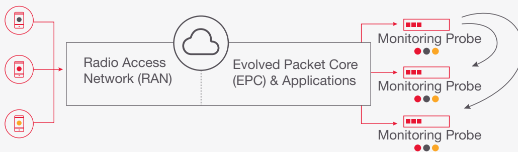
Figure 1. Probes can spend 50% of their capacity to correlate user data between themselves.

Also, a service provider's monitoring solution needs to operate at high levels. This includes processing data at line rate such that no data packets get dropped, as dropped packets will be interpreted as a sign of degraded network performance. This level of performance is increasingly important as core network speeds move from 10 GE to 40 GE and 100 GE. The monitoring solution needs to support these speeds natively at full speed. This means the data access, network packet brokers (NPBs), and monitoring tools all need to operate at peak performance.