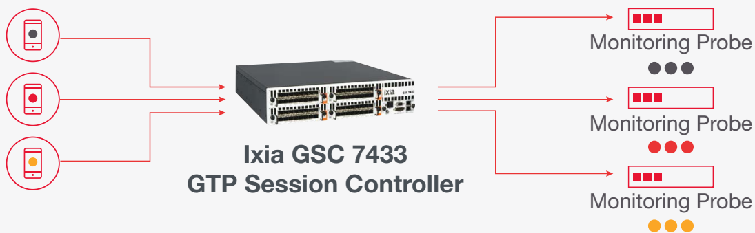
Figure 2. GTP Session Controller offloads session correlation from monitoring probes and supports scaling by distributing subscribers across multiple probes.

Ixia's General Packet Radio Service (GPRS) Tunneling Protocol (GTP) Session Controller, is a special type of NPB that enables mobile network monitoring solutions to scale. Using intelligent filtering capabilities, Ixia's solution can deliver all the network packets or a single subscriber to the same analytics and monitoring probes eliminating the need for the probe to recreate session context. This can cut CAPEX by offloading the correlation of sessions from the network monitoring probes, thereby allowing them to focus on monitoring tasks and to scale as traffic grows (see figure 2).