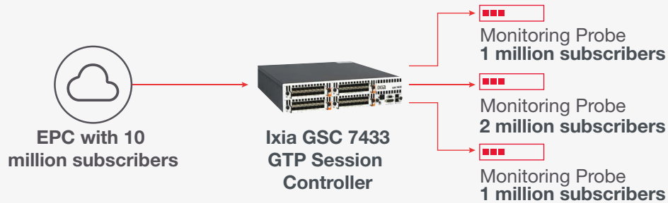
Figure 3. With Ixia's GTP Session Controller, subscriber-aware sampling can turn big data into manageable data..

Further, the solution's filtering capabilities can reduce the volume of monitored data by allowing probes to focus on specific portions of the network or on types of traffic, as for example with sensitive VoLTE or Wi-Fi calls.