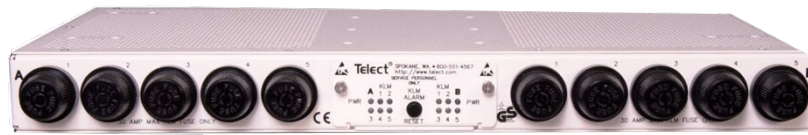
009-8004-0105 Front View