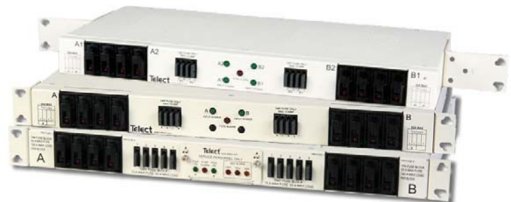
200A Dual 4/5 TPA/GMT with Bay Alarms, 009-8005-1404