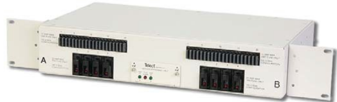
Fig. 4: 260A Dual 4/20 TPA/GMT Panel, 009-8005-0420