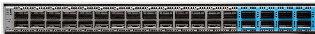
Figure 2. Cisco Nexus 93600CD Switch

The Cisco Nexus 93600CD-GX Switch (Figure 2) is a 1RU switch that supports 12 Tbps of bandwidth and 4.0 bpps across 28 fixed 40/100G QSFP-28 ports and 8 fixed 10/25/40/50/100/200/400G QSFP-DD ports. The 28 ports support 10/25-Gbps. Please see feature table below for more information.