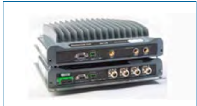
Typical Remote-End Equipment Add-On (Top) and RHU (Bottom) | Figure 2

Remote Hub Unit (RHU): The RHU is a service-specific module that performs optical to RF conversion on signals received from the BU. The signals are then filtered and amplified for transport across broadband coax to the antenna. Similarly uplink signals from the antenna are converted to optical signals before being transmitted back to the BU. Each RHU supports up to two RF services.