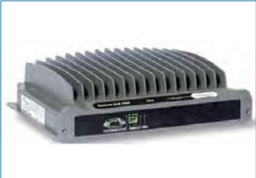
Add-On Module | Figure 7w