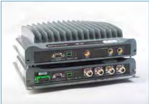
MA 1000 Tri-Service Package | Figure 4