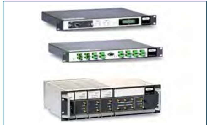
Typical Headend Equipment: SC-450 (Top), Base Unit (Middle), and RIU (Bottom) | Figure 1

Tri-Service Package (TSX): The MA1000 TSX offers a simple and cost-effective method for delivering a dedicated single carrier, three RF service deployment across a common fiber/coax antenna infrastructure. It consists of a single RHU and an Add-on mounted on a bracket.