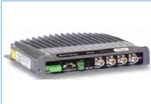
RHU | Figure 6