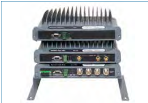
MA1000 Quad-Service Package | Figure 5