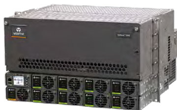
NetSure™ 5100 System, External Distribution 18 kW, 19" Rack (582137100)