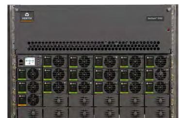
NetSure™ 5100 System, External Distribution 19.2 kW, 23" Rack (582137100)