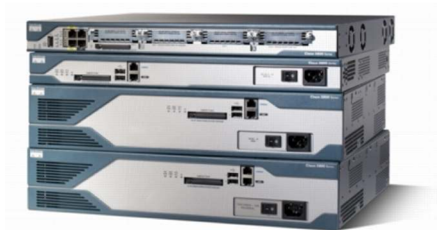
Figure 1. Cisco 2800 Series

Cisco Systems ® , Inc. is redefining best-in-class enterprise and small- to- midsize business routing with a new line of integrated services routers that are optimized for the secure, wire-speed delivery of concurrent data, voice, video, and wireless services. Founded on 20 years of leadership and innovation, the Cisco ® 2800 Series of integrated services routers (refer to Figure 1) intelligently embed data, security, voice, and wireless services into a single, resilient system for fast, scalable delivery of mission-critical business applications. The unique integrated systems architecture of the Cisco 2800 Series delivers maximum business agility and investment protection.